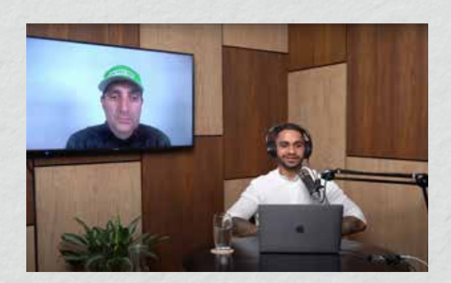
Remote Call-in Podcast