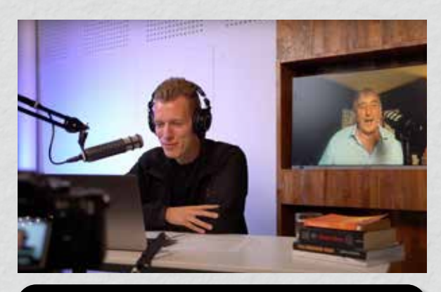
Hosting Professional Webinars