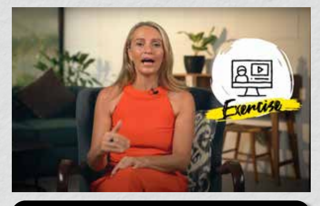
Masterclass & Course Creation