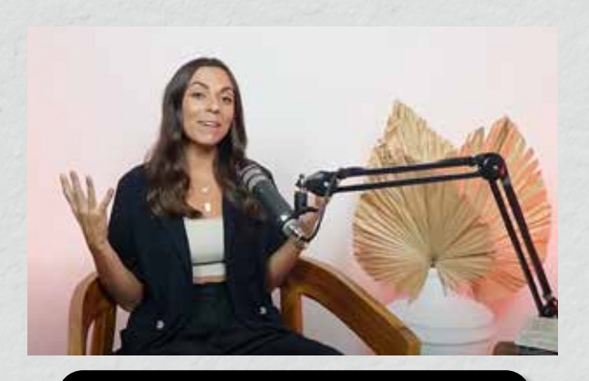
YouTube & Social Content