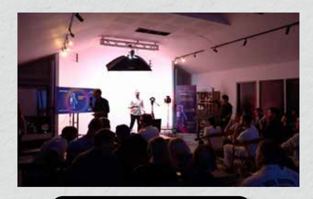
Workshops & Events