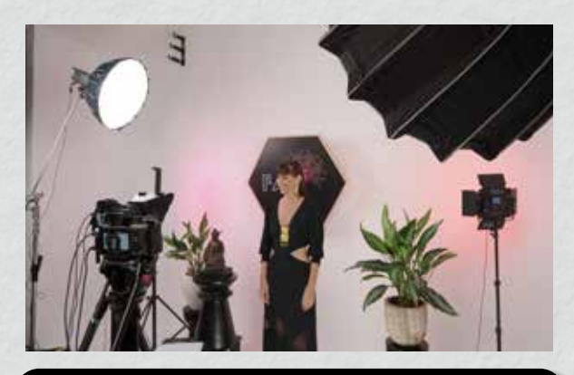
Live-Streaming & Virtual Events