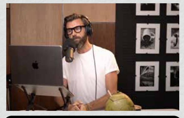
Audiobook & Voice Recording