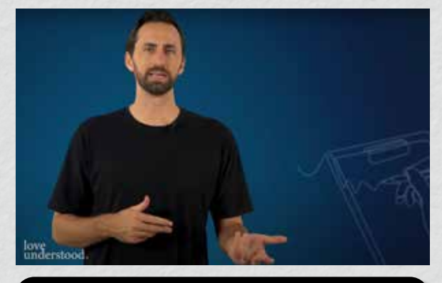
Masterclass & Course Creation